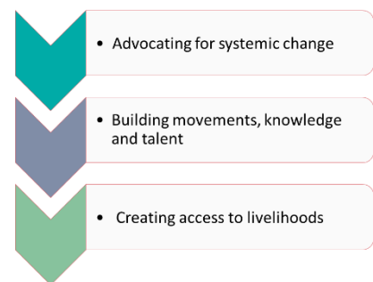
NIRMANA's A2A Roadmap

NIRMANA is most well-known for its strong advocacy. Over the years, however, NIRMANA has diversified its activities to build campaigns / movement and also addressed the last mile - the real business of creating access to livelihoods, direct services like enrolment, skilling and implementing programmes.